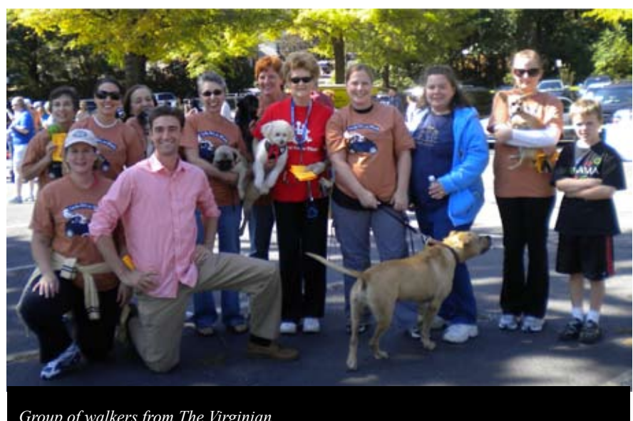
Group of walkers from The Virginian

Year after year, they make this event appear to be an easy project to pull off – getting volunteers to set up and staff pit stops and registration tables, soliciting